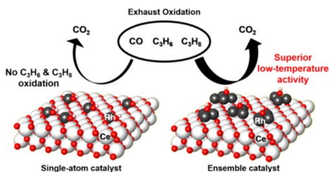
Figure 2. Structure and performance comparison of single-atom catalyst and ensemble catalyst.

In particular, the ENSs have superior low-temperature activity even better than commercial DOC, hence they are expected to be applied to automobile exhaust treatment.