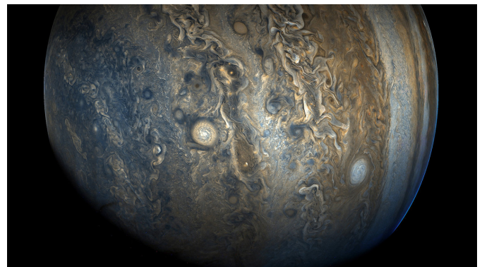
Jupiter's southern hemisphere photographed by NASA's Juno spacecraft.

With an equator diameter of around 143,000 kilometers, Jupiter is the largest planet in the solar system and has 300 times the mass of the Earth. The formation mechanism of giant planets like Jupiter has been a hotly debated topic for several decades. Now, astrophysicists of the Swiss