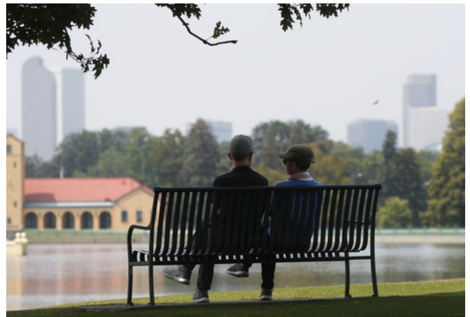
A smoky haze obstructs the skyscrapers and Rocky Mountains that usually can be seen as a backdrop to the city as a couple sits near the lake in City Park Monday, Aug. 20, 2018, in Denver. Smoke from the countless wildfires burning in western Canada as well as the American West has forced the issuance of air quality alerts across the region.

The Federal Aviation Administration said airplanes bound for the Sea-Tac International Airport, Seattle's main airport, may be delayed because of low visibility.