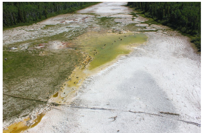
Magnesite sediments in a playa in British Columbia, Canada.

"Using microspheres means that we were able to speed up magnesite formation by orders of magnitude. This process takes place at room temperature, meaning that magnesite production is extremely energy efficient"