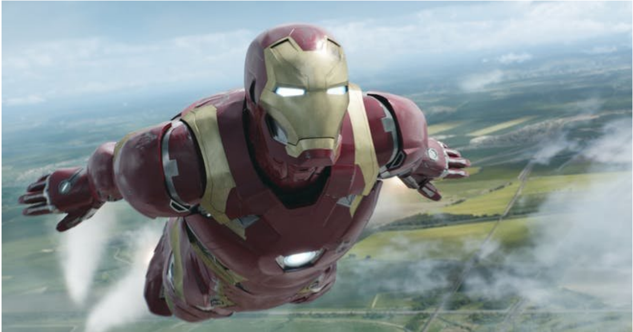
Iron Man (Stark).

Holland) his own super suit , which comes with a nameless female-voiced virtual assistant. Peter initially calls her "suit lady," later naming her Karen. Peter imbues his suit with personality and identity by naming it, but you wonder if he would have been so willing to imagine his suit as a caring confidant if it had come with a older-sounding male voice.