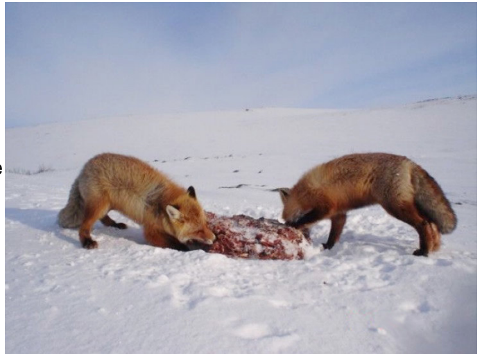
Smaller carnivores such as these red foxes, photographed in Norway, prey on different species than large carnivores. The research included photos of hundreds of different carnivores.

"And having more coyotes—because they don't tolerate foxes—results in fewer foxes, which means we have more mice in our fields and forests," he continued. "That is affecting the prevalence of Lyme disease spread by ticks that spend much of their life on certain mice. So you see, the way these carnivores compete and co-occur has implications for all of our wildlife communities."