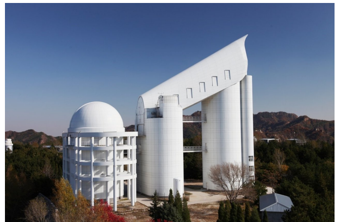
A research team, led by the astronomers from National Astronomical Observatories of China (NAOC), Chinese Academy of Sciences, discovered the most lithium-rich giant ever known to date, with lithium abundance 3,000 times higher than normal giants.

Detailed information of the star was obtained by a follow-up observation from the Automated Planet Finder (APF) telescope at Lick Observatory.