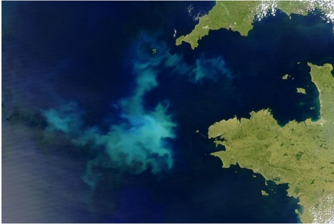
Bloom of coccolithophores visible from space.

He cautioned against too much optimism with the findings, however.