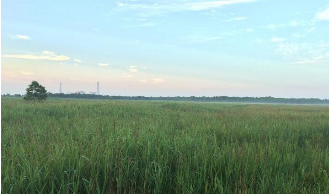
Abandoned wet farmland in central Hokkaido in Japan.

Agriculture and conversion of pristine lands into urban or industrial areas have exerted immense pressure on natural biota due to habitat destruction and fragmentation in industrialized countries around the world. But since the 1900s, farmlands have been increasingly abandoned due to the decline in domestic agriculture and, in some countries, a decline in population. This yields an opportunity for abandoned farmlands to be used as rehabilitation zones for grassland, wetland, and forest animals. However, it has so far remained unclear how valuable for sustaining specific animal communities farmlands, abandoned farmlands, and natural habitats are relative to each other.