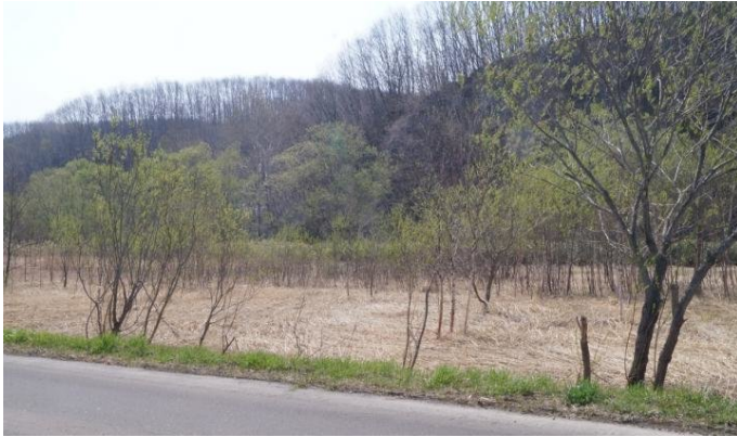
Abandoned dry farmland in central Hokkaido in Japan.