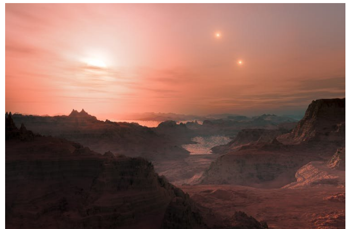
This artist's impression shows a sunset seen from the super-Earth Gliese 667 Cc, in its star's habitable zone.

There may be other possibilities, too – scientists are looking through all possible small molecules to identify biosignatures that we haven't thought of yet.