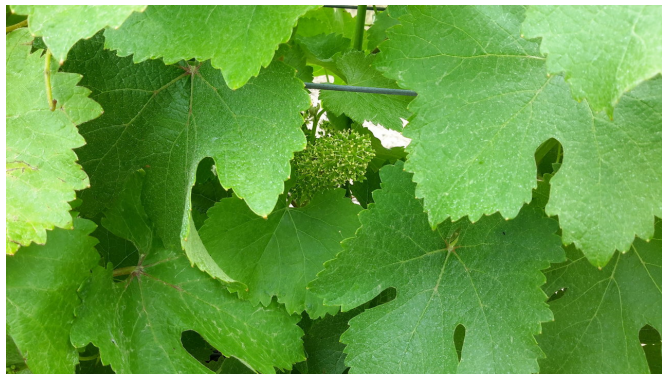
Manganese compounds also play a role as catalysts in photosynthesis.

An international team has made a breakthrough at BESSY II. For the first time, they succeeded in investigating electronic states of a transition metal in detail and drawing reliable conclusions on their catalytic effect from the data. These results are helpful for the development of future applications of catalytic transition-metal systems. The work has now been published in Chemical Science , the Open Access journal of the Royal Society of Chemistry.