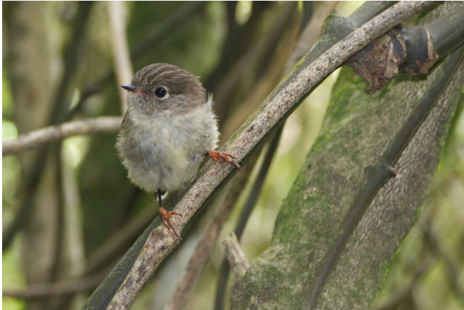
Picture of a female New Zealand Tomtit ( Petroica macrocephala ) perching on a branch in South island. It's specific name, literally means "big head", referring to its large head in comparison to other members of its genus.

A team of researchers from Sweden, Canada and Spain has found evidence suggesting that birds that live on islands tend to have bigger brains than their mainland cousins. In their paper published in the journal Nature Communications , the group describes their analysis of data on over 1800 bird species and what they found.