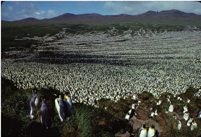
Île aux Cochons king penguin colony in 1982.

The world's biggest colony of king penguins is found in the National Nature Reserve of the French Southern and Antarctic Lands (TAAF). Using high-resolution satellite images, researchers from the Chizé Centre for Biological Studies (CNRS / University of La Rochelle) have detected a massive 88 percent reduction in the size of the penguin colony, located on Île aux Cochons, in the Îles Crozet archipelago. The causes of the colony's collapse remain a mystery but may be environmental.