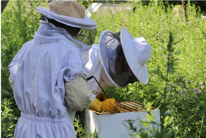
Transferring the frame for harvesting.

Royal jelly, or milky-white "bee milk," has long been known for its mysterious growth effects on future queen honey bees, while also hailed by some as an anti-aging, cholesterol-lowering super supplement. But how this "queen magic" actually happens, and its potential benefit to humans, has remained a mystery to scientists.