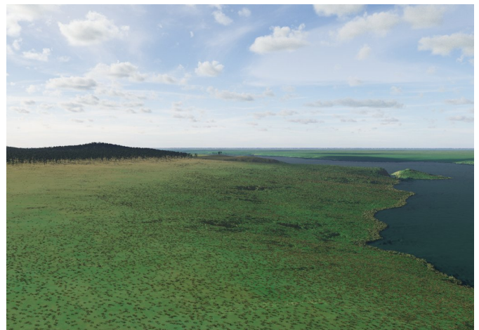
Before it was lost to the bottom of sea, Doggerland was made up of woodland, meadows, marshes and rivers, as shown by simulations.