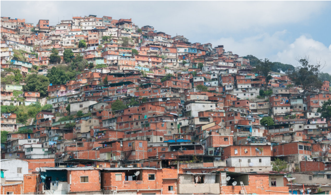
Slums in Caracas, Venezuela.

Humans are the most populous large mammal on Earth today, and probably in all of geological history. This World Population Day , humans number in the vicinity of 7.5 to 7.6 billion individuals.