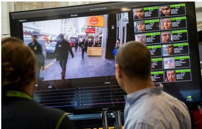
A display shows a facial recognition system for law enforcement during the NVIDIA GPU Technology Conference in 2017 in Washington

The unique features of your face can allow you to unlock your new iPhone, access your bank account or even "smile to pay" for some goods and services.