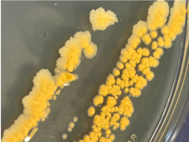
Bacteria growing after being frozen.

The survival mechanisms of polar fish have led scientists at the University of Warwick to develop of a revolutionary approach to 'freeze' bacteria. The new technique could radically improve the work to store and transport human tissue.