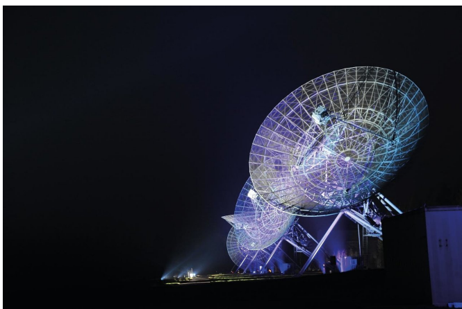
The Westerbork Synthesis Radio Telescope in the Netherlands was one of three telescopes used to study the three-star system, along with the Green Bank Telescope in West Virginia and the Arecibo Observatory in Puerto Rico.