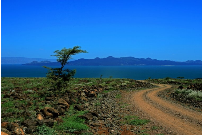
Lake Turkana in Kenya could be added to the List of World Heritage sites in Danger at an annual meeting in Bahrain

Inuit hunting grounds, World War I cemeteries, Art Deco heritage in Mumbai and Italy's wine-producing Prosecco hills are among 30 hopefuls in the running to join UNESCO's famous list as the World Heritage Committee meets from Sunday in Bahrain.