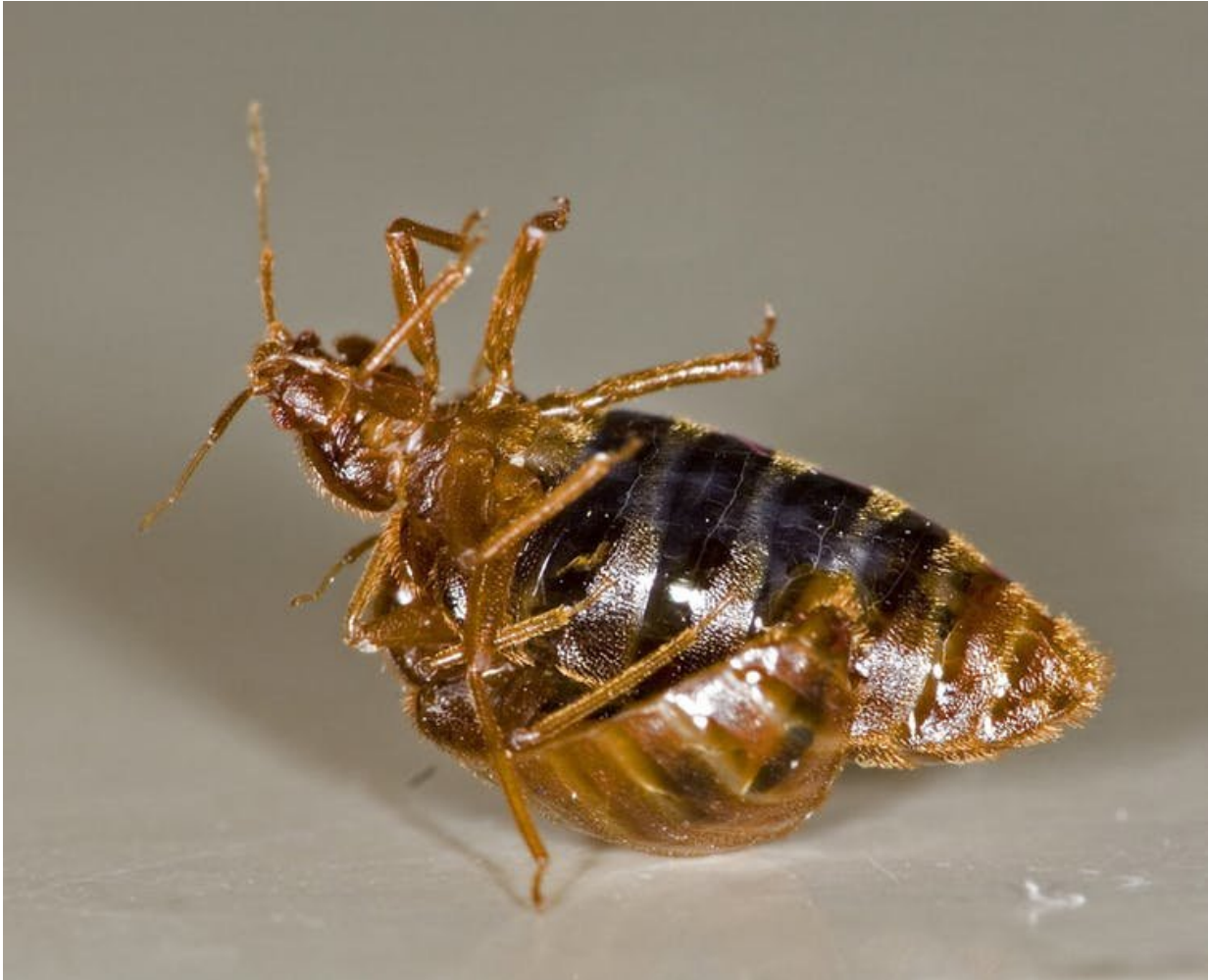
Bed bugs: traumatic insemination.

fertilise females indirectly by loading sperm onto male rivals who unwittingly transfer it in subsequent matings.