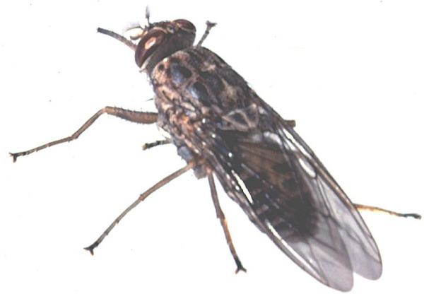
Tsetse fly.

Before they migrate, the trypanosomes accumulate in a particular part of the tsetse fly gut. This allowed researchers to study this population of microbes in detail over a time course of several days to find out exactly what they do.