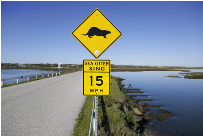
In this photo taken Monday, March 26, 2018, a sign warns motorists of sea otters at the Elkhorn Slough in Moss Landing, Calif. Along 300 miles of California coastline, including Elkhorn Slough, a wildlife-friendly pocket of tidal salt marsh and rich seagrass in the curve of Monterey Bay, southern sea otters under state and federal protection as a threatened species have rebounded from as few as 50 survivors in the 1930s to more than 3,000 today.

Wildlife officials have made efforts around the world to restore predators ranging from birds of prey to bears, sometimes controversially when people believe the animals are a threat to them or their livelihoods.