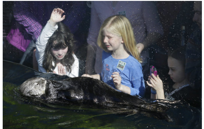
In this photo taken Monday, March 26, 2018, three girls watch a sea otter pass by during its afternoon feeding at the Monterey Bay Aquarium in Monterey, Calif. California sea otters, once thought wiped out by the fur trade, are booming again in a federally-protected enclave of Northern California coast. But outside that sanctuary, a new study finds, a chain of unintended bad consequences has followed man's removal of otters as a top predator of the sea, and is preventing the furry creature's return to its former range from Baja California north.

To help the kelp, commercial divers along Northern California's Mendocino coast are tending a precious stand of kelp forest, plucking off the purple sea urchins by hand and using suction hoses to