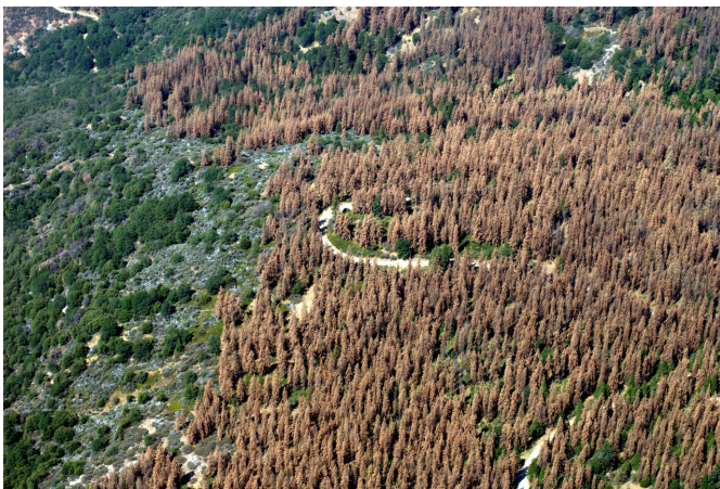
This August 2016 aerial photo of the Sierra Nevada Mountains in central California shows widespread tree