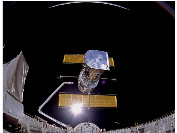
The Hubble Space Telescope.

Old data was stored in the form of photographic plates or published catalogs. But accessing archives from other observatories could be difficult – and it was virtually impossible for amateur astronomers.