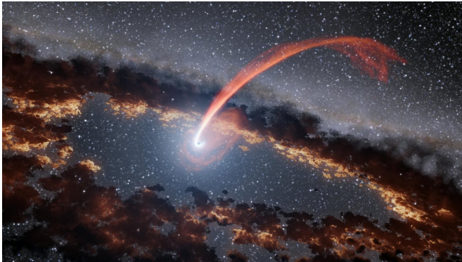
An artist's illustration of a black hole "eating" a star. Credit: NASA/JPL-Caltech

Earlier this year, astronomers stumbled upon a fascinating finding: Thousands of black holes likely exist near the center of our galaxy.