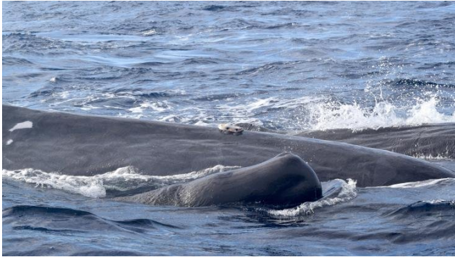
A tagged sperm whale mother with her calf, in the offshore waters of the Santos Basin, Brazil.

When dolphins dive deep to search for prey, their respiration stops. Their heartbeat slows. Yet they are still able to power all of the functions they need to hunt. No one is entirely sure how they do it, because no one has ever been able to measure their blood oxygenation levels during these deep dives. It's a logistically complex challenge; how do you attach a sensor to a massive sea-dwelling creature without doing harm? The rudimentary data that researchers have gathered so far has come from heart rate monitors bound to dolphins' bodies with thick, wide neoprene straps—dolphin girdles, essentially.