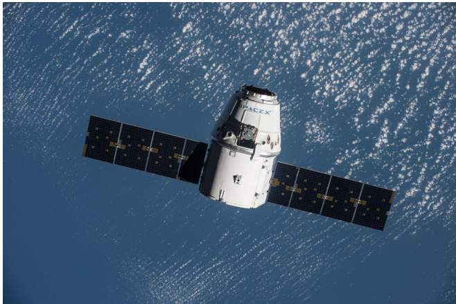
The SpaceX Dragon spacecraft arrives at the International Space Station. The SpaceX Dragon spacecraft arrives at the International Space Station.

A team of researchers, which includes the University of Southampton, have developed new technology which could prompt a significant change for a spacecraft or satellite.