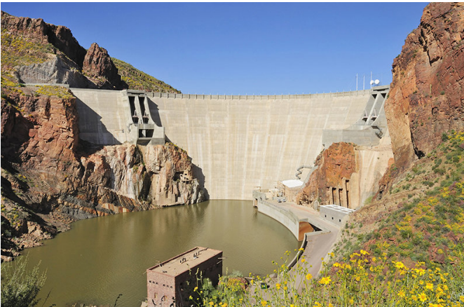
Roosevelt Dam, in Globe, was completed in 1911. It was the first of a series of projects that eventually would store some 5 million acre-feet of surface water in reservoirs within the state.