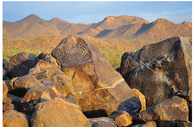
In Arizona's Saguaro National Park, Signal Hill Trail leads to petroglyphs by the ancient Hohokam people, who sustained themselves in the desert by drawing from the Salt and Gila rivers.

According to Megdal, while there is always room from improvement, both Tucson and Phoenix are rising to the challenge now more than ever. In both cities, per-capita use of water is decreasing. In Tucson, the total use of water is the same today as it was 30 years ago, when the city's population was closer to 420,000.