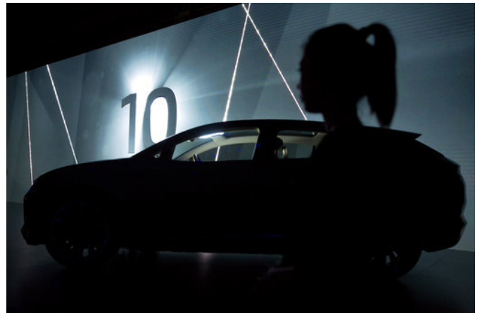
In this April 20, 2018, photo, a woman stands near the silhouette of an electric concept car from auto startup BYTON during a press event held ahead of the Auto China 2018 in Beijing, China. Auto China 2018, the biggest global auto show of the year, showcases China's ambitions to become a leader in electric cars and the industry's multibillion-dollar scramble to roll out models that appeal to price-conscious but demanding Chinese drivers.

The Cabinet's planning agency announced last week Beijing will loosen those controls by allowing full foreign ownership in the industry, starting with electric vehicle producers this year. Limits for commercial vehicles would end in 2020 and for all passenger vehicles in 2022.