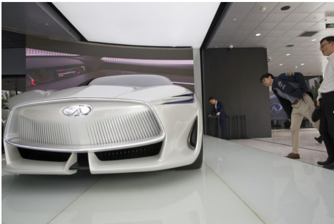
In this April 19, 2018, photo, visitors look at the Infiniti electric concept sedan at a showroom ahead of the Auto China 2018 to be held in Beijing, China. Auto China 2018, the biggest global auto show of the year, showcases China's ambitions to become a leader in electric cars and the industry's multibillion-dollar scramble to roll out models that appeal to price-conscious but demanding Chinese drivers.