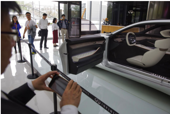
In this April 19, 2018, photo, visitors look at the Infiniti electric concept sedan at a showroom ahead of the Auto China 2018 to be held in Beijing, China. Auto China 2018, the biggest global auto show of the year, showcases China's ambitions to become a leader in electric cars and the industry's multibillion-dollar scramble to roll out models that appeal to price-conscious but demanding Chinese drivers.

The Japanese automaker also plans to develop a lower-priced electric with a local partner, state-owned Dongfeng Motor Co. Two more versions of that are to be sold under their jointly owned Venucia brand.