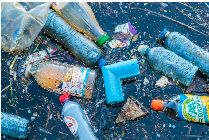
Plastic crisis.

There is one worry, though. While any modified bacteria used in bioreactors are likely to be highly controlled, the fact that it evolved to degrade and consume plastic in the first place suggests this material we rely on so heavily may not be as durable as we thought.