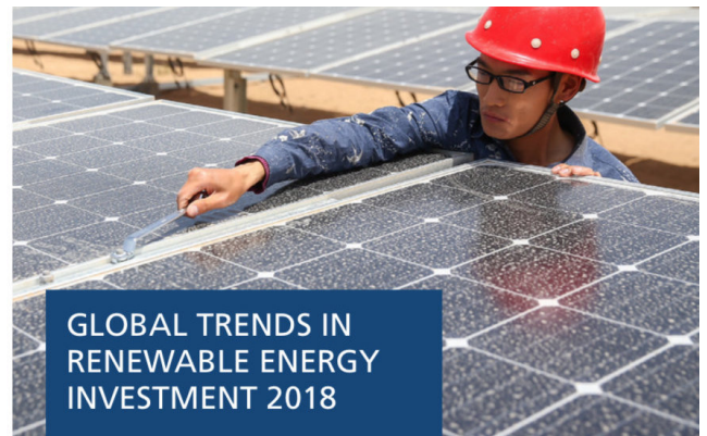
GLOBAL TRENDS IN RENEWABLE ENERGY INVESTMENT 2018

Overall, China was by far the world's largest investing country in renewables, at a record $126.6 billion, up 31 per cent on 2016.