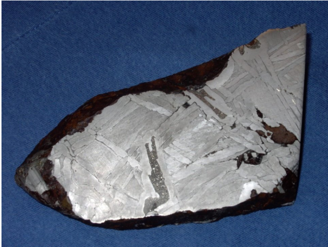
A 15cm wide fragment of the Seymchan iron-nickel meteorite found in Russia in 1967. The long filament of dark grey material in the centre is the phosphorus-rich mineral schreibersite.