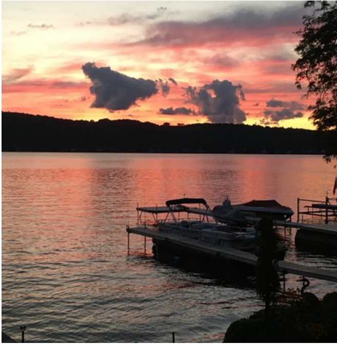
Finger Lakes region of New York.

The lovely smell that follows a spring rain as you sit on your porch and enjoy the sound of drips pattering on the lawn is so loved that it has earned the distinct honor of its own word: "petrichor." Somewhat less romantic is the source of the smell: a mix of plant oil and bacterial by-product. Despite that, when I was young, living in Conesus, New York, I learned to love rainy days. There is something especially relaxing about being inside while the sky outside is unleashing millions of gallons of water onto the earth.