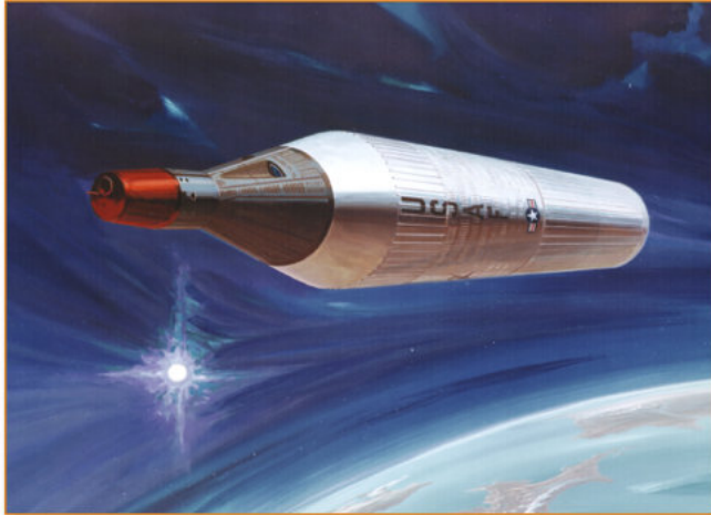
Artist's depiction of the proposed Manned Orbiting Laboratory (MOL) vehicle platform. Credit: Douglas Aircraft Co., 1967

Alongside the well-known hazards of space—freezing temperatures, crushing pressures, isolation—astronauts also face risks from radiation, which can cause illness or injure organs.