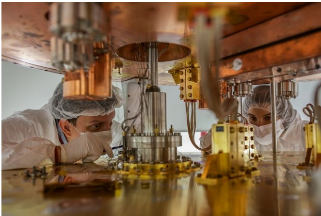
Researchers working on the cryostat.