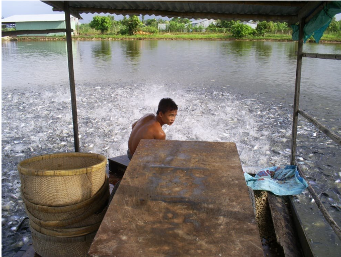
Farming pangasius catfish for export in Vietnam.