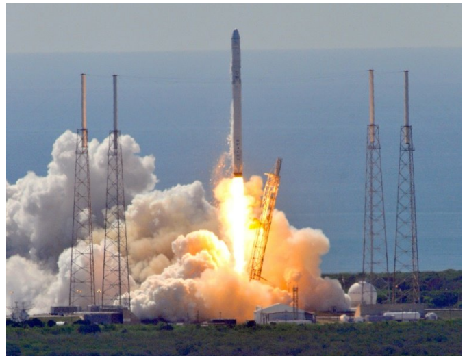
Space X's Falcon 9 rocket as it lifts off from Cape Canaveral, Florida June 28, 2015 with a Dragon CRS7 spacecraft

It seems like old news now, but SpaceX made history in 2010 by becoming the first private company to send its own spaceship to orbit and recover it.