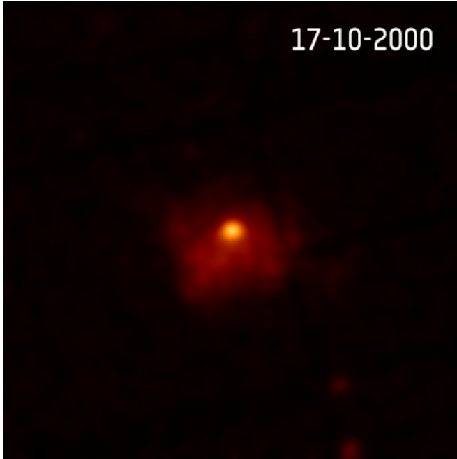
Stellar wind evolution.

ESA's XMM-Newton has spotted surprising changes in the powerful streams of gas from two massive stars, suggesting that colliding stellar winds don't behave as expected.