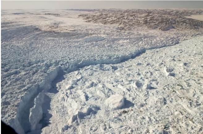
The calving front of the Jakobshavn glacier in western Greenland. The Jakobshavn is a potential site for the proposal's walls.

attempt to slow down or even reverse the Earth's rising temperatures as an alternative to reducing GHG emissions. Some propose to add aerosols like sulfur dioxide to the atmosphere, or increase the reflectivity of clouds, to reduce atmospheric heating. Others explore ways to capture and sequester carbon.