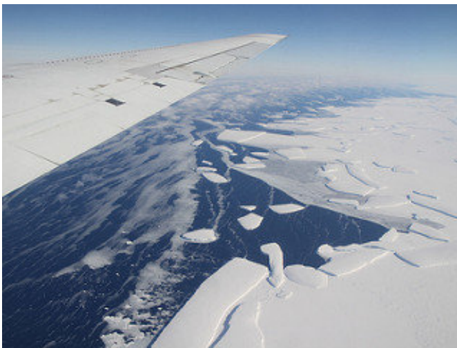
The calving front of a glacier in West Antarctica.

Would these walls work in actuality? Wolovick's computer modelling is in its early stages, but some models show glaciers stabilizing after walls are put in place, with some glaciers actually gaining in mass. This possible stabilization would buy some time to act decisively on adaptation to sea level rise and perhaps allow the prevention of disastrous ice sheet collapse altogether. Still, Wolovick admits a lot more work needs to be done in the future, including the development of better ocean models to see if the walls would block warmer water in the way intended, allowing a glacier to stabilize.