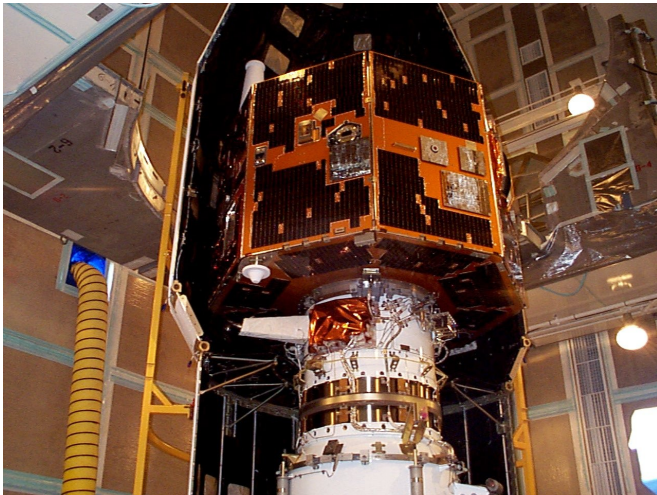
The IMAGE spacecraft undergoing launch preparations in early 2000.

The identity of the satellite re-discovered on Jan. 20, 2018, has been confirmed as NASA's IMAGE satellite.