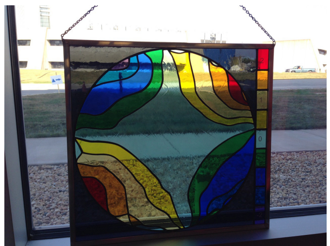
Stronger magnetic fields are shown in deeper colors.

of imperfection in the field, with the red and blue areas showing the greatest nonuniformities. Although it looks as though there are huge variations in the field between the center and the edges, even the darkest colors in the map represent a discrepancy from the desired field strength of just two parts per million. And it's getting even better.