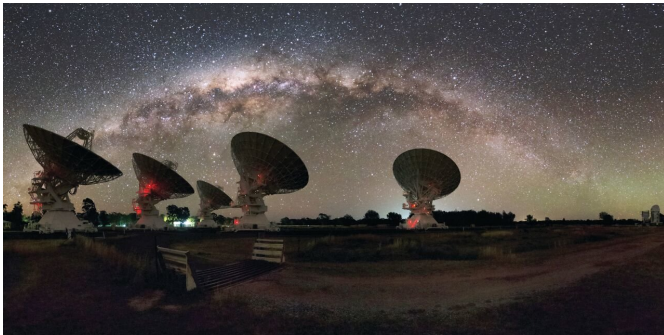
The CSIRO Australia Telescope Compact Array has monitored radio waves from the neutron-star merger, 130 million light-years away.