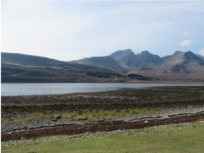
Site 1 is above the treeline in the mid-ground far side of Loch Slapin.

Geologists exploring volcanic rocks on Scotland's Isle of Skye found something out-of-this-world instead: ejecta from a previously unknown, 60 million-year-old meteorite impact. The discovery, the first meteorite impact described within the British Paleogene Igneous Province (BPIP), opens questions about the impact and its possible connection to Paleogene volcanic activity across the North Atlantic.