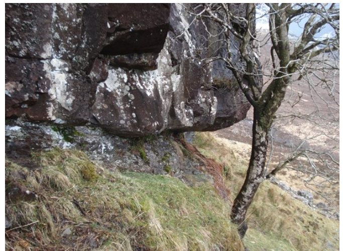
Recessed meteoritic ejecta layer site 1.1-m-thick deposit beneath thick sequence of basaltic lava flows.

A second site, seven kilometers away, proved to be a two-meter-thick ejecta layer with the same strange mineralogy. The researchers pin the impact to sometime between 60 million and 61.4 million years ago (Ma), constrained by a 60 Ma radiometric age for the overlying lava flow, and 61.4 Ma for a basalt clast embedded within the ejecta layer. The team published their discovery in Geology this week.