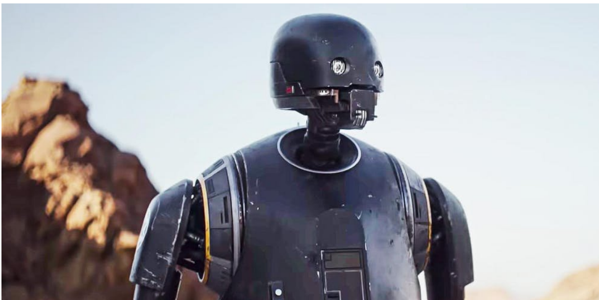
K2-SO in Rogue One.