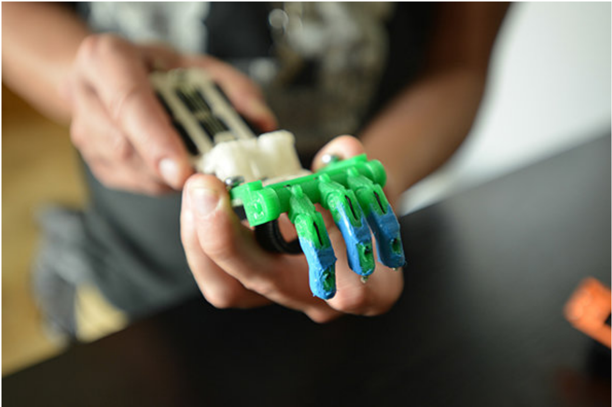
A low-cost 3-D printed prosthetic hand.