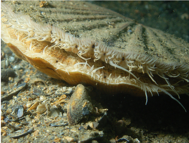
Whole Pecten Maximus with eyes.

Scallops may look like simple creatures, but the seafood delicacy has 200 eyes that function remarkably like a telescope, using living mirrors to focus light, researchers said Thursday.