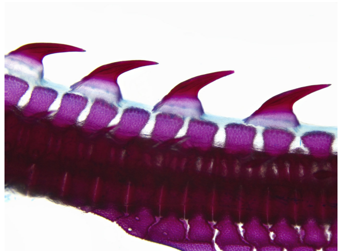
Image of a row of jagged, tooth-like denticles running down the length of the skate trunk and tail. The denticles are the tooth-like organs arranged in a line above the vertebral column.

The findings, published in the journal PNAS , support the theory that, in the depths of early evolution, these 'denticle' scales were carried into the emerging mouths of jawed vertebrates to form teeth. Jawed vertebrates now make up 99% of all living vertebrates, from fish to mammals.