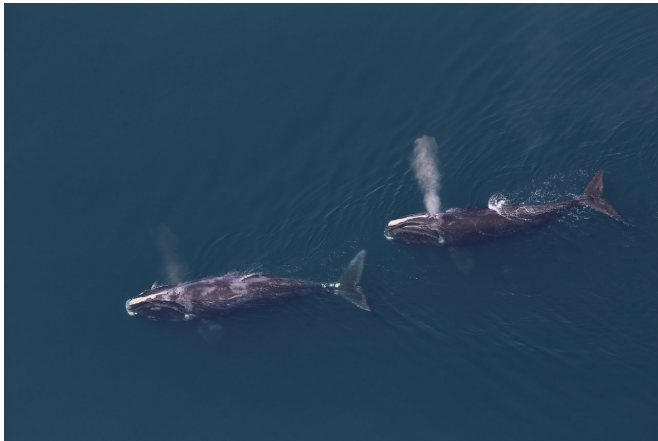
North Atlantic right whales photographed by the NEFSC aerial survey team in May 2016.

A new study confirms what marine mammal researchers have suspected for a while: right whales use nearly the entire eastern seaboard during the winter, and they move around a lot more than was previously thought. How long they spend in some areas of their range has also changed in recent years.