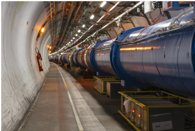
View of the LHC tunnel.

It's the end of the road for the protons this year after a magnificent performance from the Large Hadron Collider (LHC). On Friday, the final beams of the 2017 proton run circulated in the LHC. The run ended, as it does every year, with a round up of the luminosity performance, the indicator by which the effectiveness of a collider is measured and on which the operators keep a constant eye.