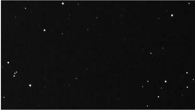
Asteroid 2012 TC4 glides across a field of background stars in this animation taken on Oct. 11, 2017, by the 3.3-foot (1.0-meter) Kiso Schmidt telescope in Nagano, Japan.

An international team of astronomers led by NASA scientists successfully completed the first global exercise using a real asteroid to test global response capabilities.